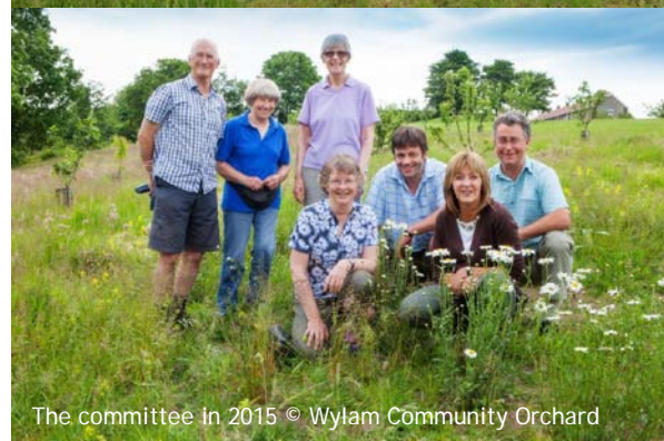
The committee in 2015