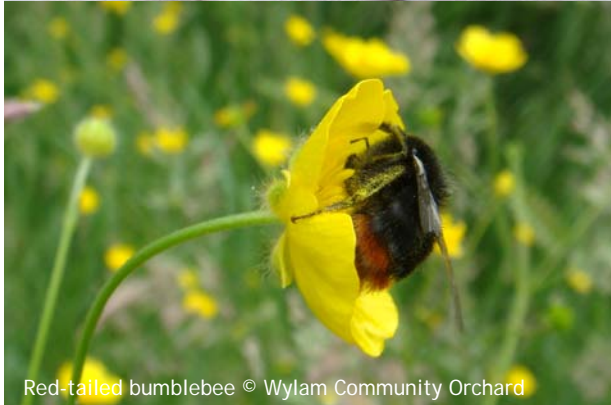
Red-tailed bumblebee