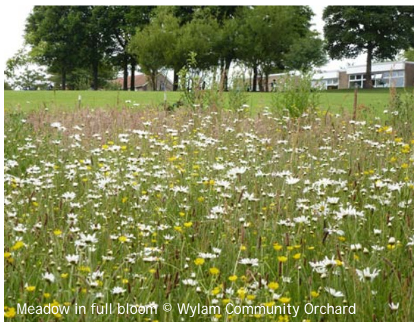
Meadow in full bloom

Although each year some species are lost, more are gained. The biodiversity group is interested in why species flourish or not. Alison says: "It is sometimes difficult to understand why species do not thrive. In 2016 we lost ragged robin which likes wet ground, despite the storms of the previous winter which left the site saturated." They also chart the provenance of species. Very few of the flowers are self-seeded, probably because the site is surrounded by species-poor fields. The bulk of the flowers come from the hay meadow seed, which contains yellow rattle, an important plant for the establishment of the meadow over the first four years. The seed also contains typical meadow species for the area, such as eyebright, ribwort plantain and common sorrel. Plugs and bulbs planted