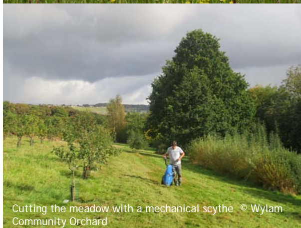
Cutting the meadow with a mechanical scythe