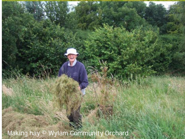
Making hay