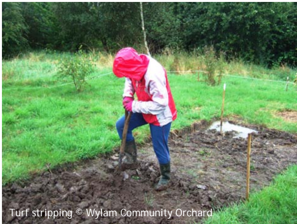
Turf stripping