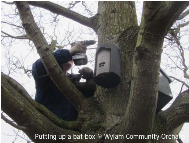
Putting up a bat box