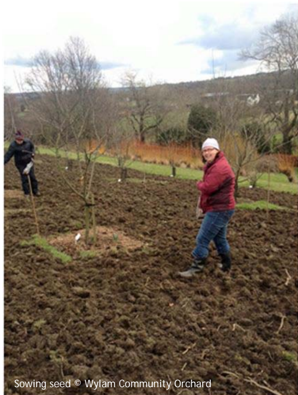
Sowing seed © Wylam Community Orchard