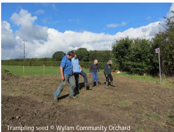
Trampling seed

time, volunteer work parties have taken place fortnightly for most of the year for two hours on Sundays, and all of the dates were and are still advertised in the village and the local press. We estimate that the site takes 300 volunteer hours per year."