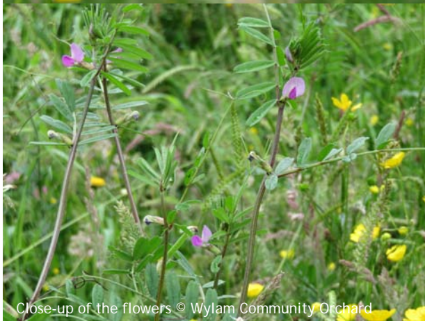
Close-up of the flowers

by volunteers make up the rest. In spring cowslips and primroses are increasing, along with small patches of snake's head fritillary and water avens, and more English bluebells have appeared in the small woodland glade. Summer flowers include an abundance of yellow-rattle, ox-eye daisy and meadow buttercup in June, followed by black knapweed, meadow crane's-bill and common bird's-foot-trefoil in July.