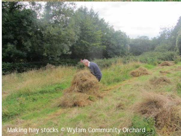
Making hay stocks